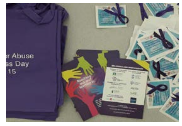
World Elder Abuse Awareness Day, June 2018.