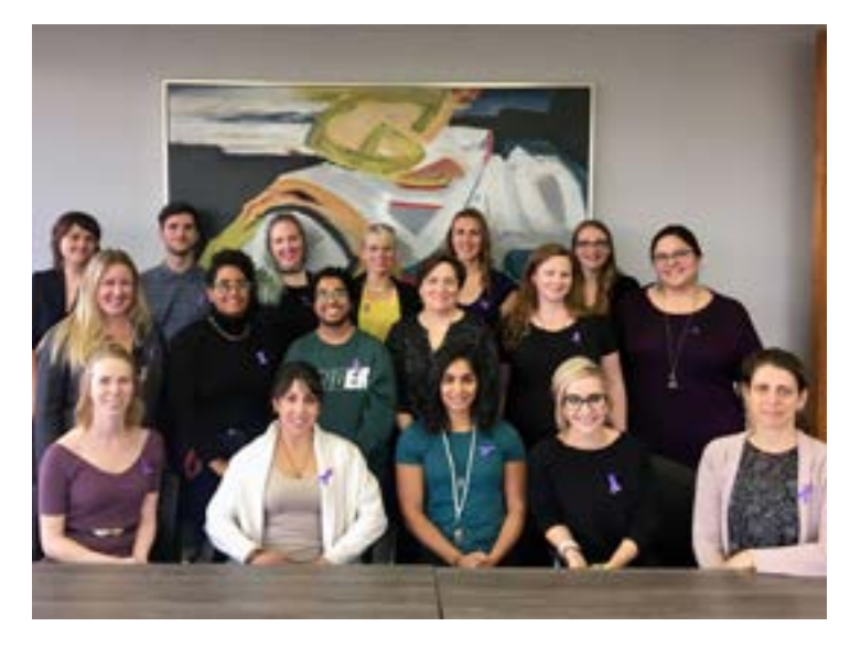
Domestic Violence Awareness Month, November 2018.

20% of SACE counselling clients are children and youth under 18