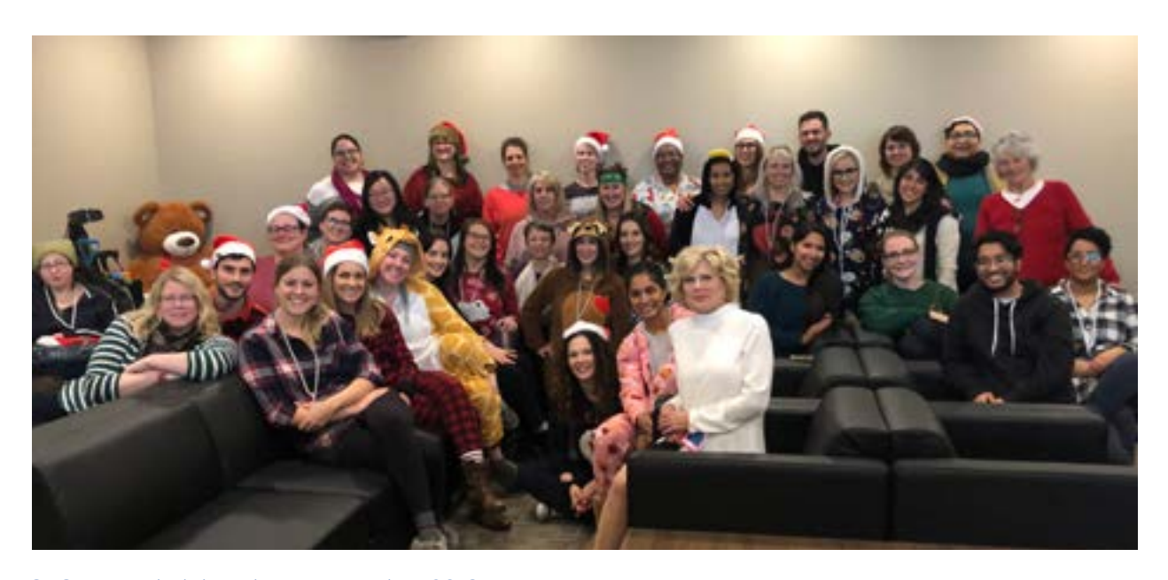
SACE team holiday photo, December 2018.