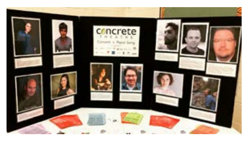
The 2018 SACE Concrete Theatre Team.