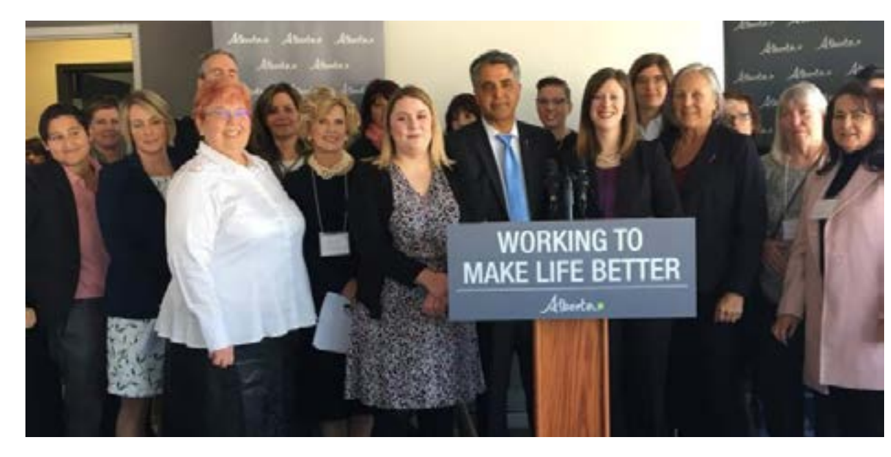
The new SACE Police and Court Support Program was made possible by an increase to our core funding from Alberta Justice and Solicitor General, part of a 2018 initiative together with Alberta Community and Social Services and Alberta Health to address the increased demand for sexual assault services across the province.