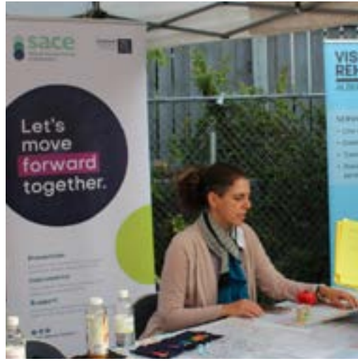
6th Annual Diversity Health Fair at Action for Healthy Communities, August 2018.